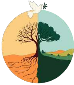
Garden of Peace Isaiah 32:14-18