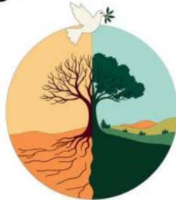
Garden of Peace Isaiah 32:14-18