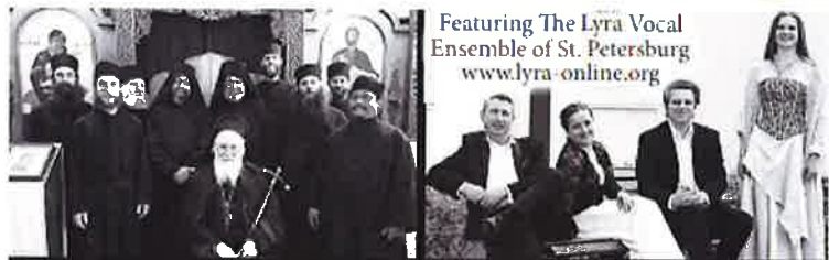
Featuring The Lyra Vocal Ensemble of St. Petersburg www.lyra-online.org