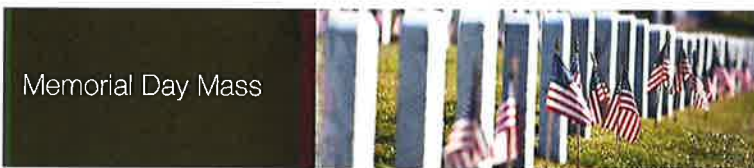
Memorial Day Mass

Thursday Evenings 6—7:30 PM @ St. Mary Parish Two groups—one will be for single, widowed & divorced ladies, another will be for everyone June 6, 13, 20, 27, July 11, 18 (extended session), 25, August 1, 8, 15, 22