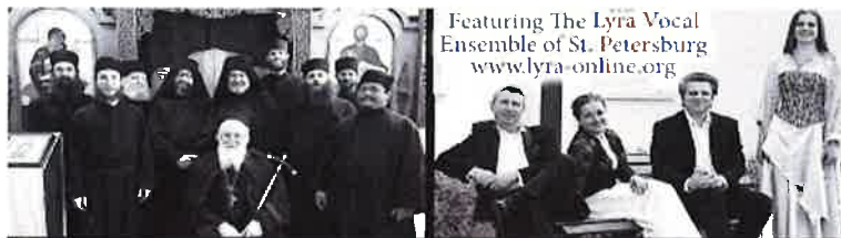
Featuring The Lyra Vocal Ensemble of St. Petersburg www.lyra-online.org