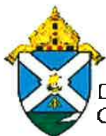
Diocese of Green Bay